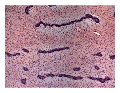
Figure 4 Benign neoplasm consisting of mesenchymal tissue associated with odontogenic epithelium arranged in short and long, narrow cords or islands (H&E 200x).

Therefore, surgery was indicated and performed under general anesthesia, with curettage of the lesion and tooth extraction (Figure 5). AF diagnosis was confirmed. A helicoidal tomography was performed 8 months after surgery (Figure 6). The patient has been followed-up with no evidence of recurrence, and has been asymptomatic ever since (Figure 7).