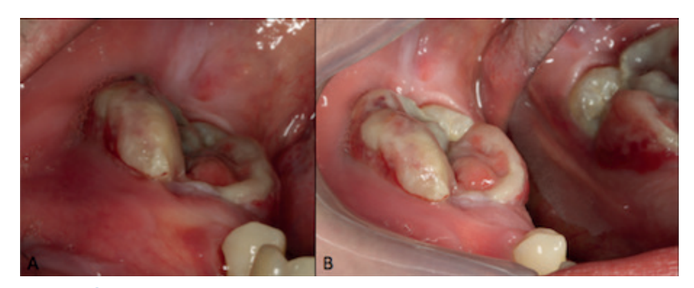
Figure 2 A,B: An ulcerated tumor due to chewing, affecting the posterior right mandible and causing expansion of the cortical bone.

of the mandible. Helicoidal computed tomography (HCT) soft window image revealed a hypodense image with isodense content, and cortical bulging with rupture of alveolar crest.