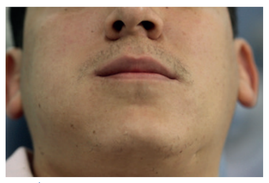
Figure 1 Extraoral examination revealed facial asymmetry with bulging of the lower third of the face and intact skin, on the right side.

The intraoral examination revealed a tumor in the right mandible, with an ulcerated surface, a reddish color, well-defined borders, and measuring approximately 3 cm. Absence of the second premolar and the first and second molars was noted in the region of the tumor.