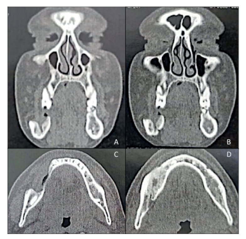
Figure 7 A, B: HCT coronal view shows an area of bone defect from surgery, with no evidence of lesion. C, D: HCT axial view shows a hyperdense area, suggesting a process of bone repair in the right mandible.