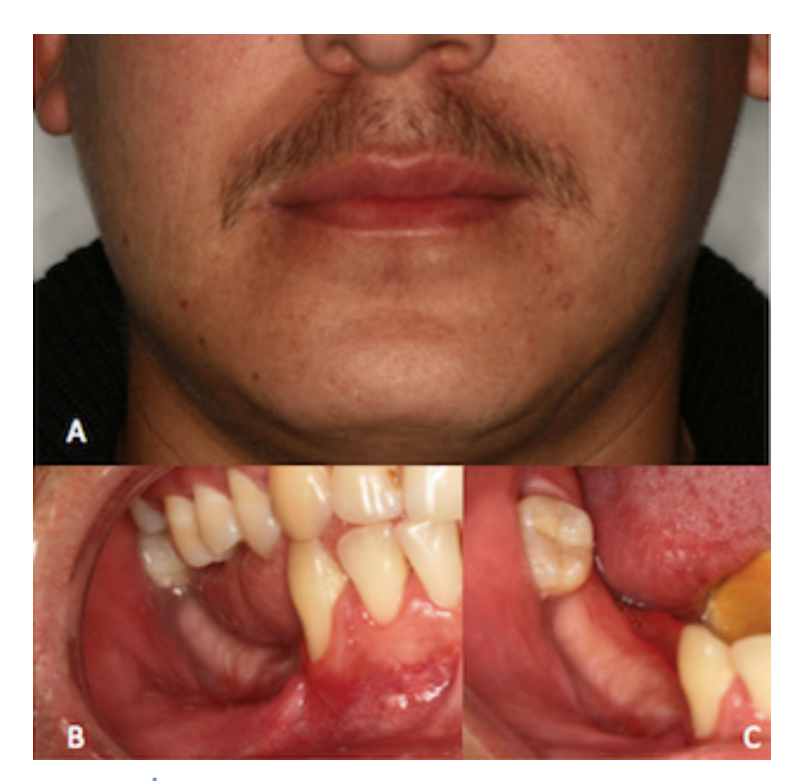
Figure 6 A : Five months after surgery, the patient presented symmetry. B, C: Intraoral examination revealed normal alveolar ridge and intact surface.