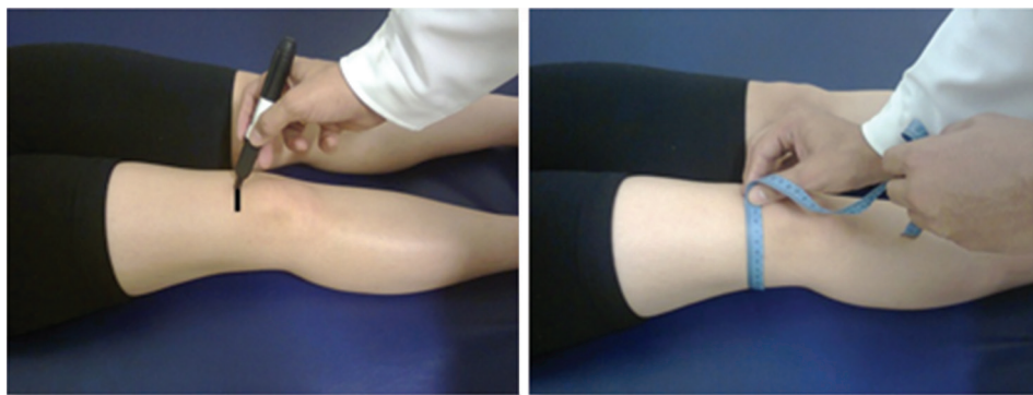
Figure 1. Standardized procedure to evaluate the circumference of the knee