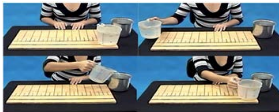
Figure 2. Sub-items of the Elui Test - Pouring water (Initial position and the performing phases of the item)