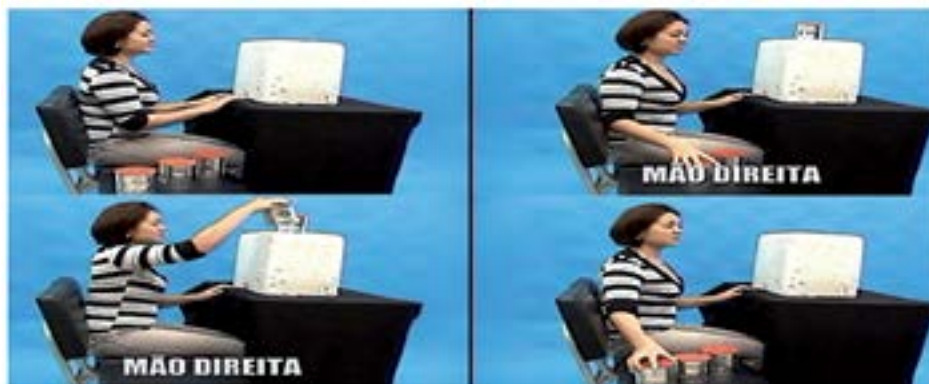
(Initial performance phase of the items: Picking up large object, either light or heavy, with the initial phase of placing the object into the styrofoam box. Final performance phase of the items: Picking up large object, either light or heavy, and returning the object to the chair.)