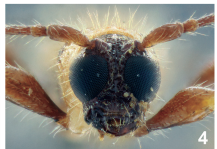
FIGURES 1-4: Eclipta birai sp. nov., holotype female: (1) dorsal view; (2) ventral view; (3) lateral view; (4) head, frontal view.