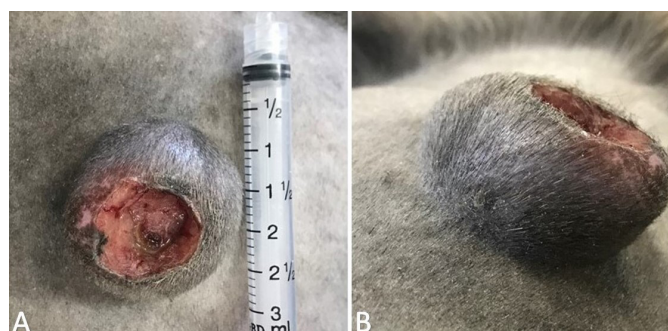
Figure 1 – Well-circumscribed mass located on the left scapular region, well-defined margins and presence of ulceration at the center. (A) The size of the cutaneous mass was determined by measuring the neoplasm with the scale (calibration markings) printed on the barrel of a 3 ml syringe. (B) Lateral views of the neoplastic nodule.

The tumor mass was surgically removed twenty days after cytological exam. The anesthetic premedication was done with Tramadol hydrochloride (3 mg/kg, subcutaneous), Midazolam (0.25 mg/kg, intramuscular) and Ketamine (5 mg/kg intramuscular). Venous access was performed, and Propofol (2.5 mg/kg) was used for induction. After intubation, anesthetic maintenance was established with Isoflurane and oxygen in a semi-open Baraka circuit. The incision was performed in horizontal ellipse around the neoplastic mass with a safety surgical margin of approximately 0.5 cm Tumor adhesions were not observed during the surgical procedure. The subcutaneous tissue was suture with absorbable, synthetic, multifilament, 3-0 polyglycolic acid