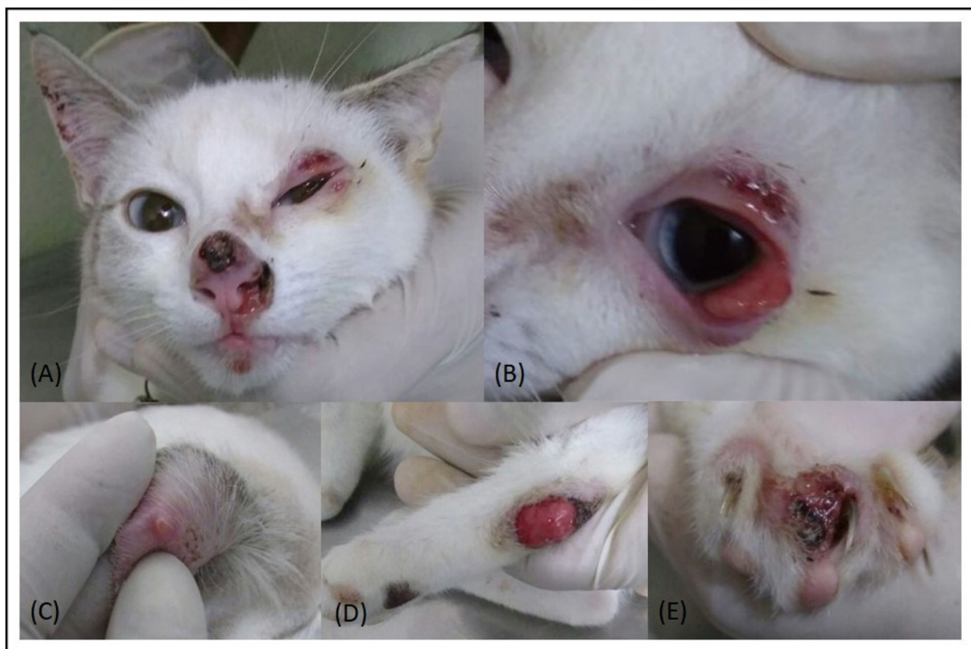
Figure 1 – Domestic feline diagnosed with cutaneous and mucosal disseminated sporotrichosis, showing: (A) erythematous, nodular and ulcerated skin lesions in face topography (nasal, ocular, and pinna); (B) Granulomatous lesion on the inner face of the conjunctival sac of the left eye; (C) Nodular lesion on the inner side of the ear; (D) Left metatarsal region and (E) Digital left pad of the thoracic limb.