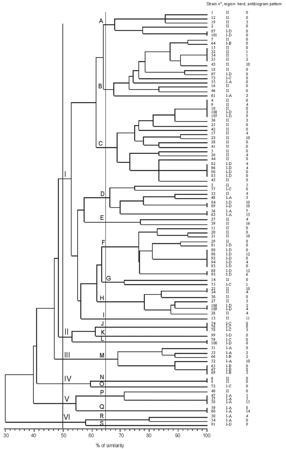
Figure 2 - Genetic relationship among the bovine S. aureus strains as estimated by clustering analysis by rep-PCR