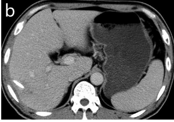
Fig. 2. In a 53-year-old liver abscess male without diabetes mellitus, the contrast-enhanced portal-venous phase CT images depict the preoperative liver abscess cavity (a) and the shrinkage of it (b), and no pus drainage can be found 18 days after the CT-guided interventional therapy.