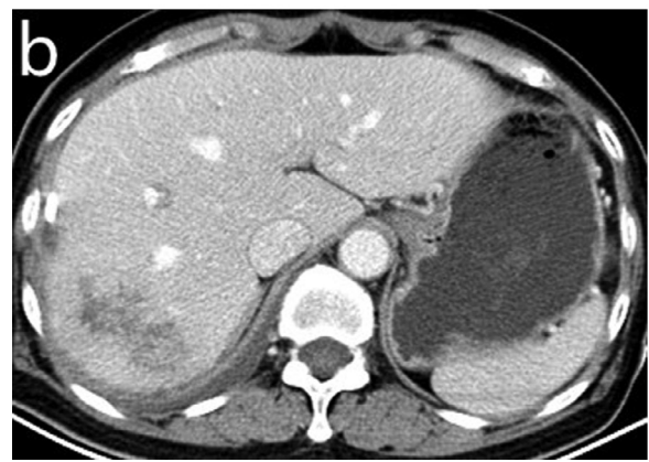
Fig. 1. In a 56-year-old liver abscess male with diabetes mellitus, the contrast-enhanced portal-venous phase CT images show the preoperative liver abscess cavity (a), and the obvious shrinkage of it (b) and no pus can be drained 32 days after the CT-guided interventional therapy.

invasive procedure and has replaced surgery as the first-line treatment for liver abscess. <sup>22</sup> The purpose of this study was to compare the changes in clinical and CT characteristics related to LA before and after CT-guided interventional therapy between patients with and without DM so as to improve the therapeutic effects of LA patients.