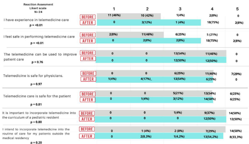
Fig. 3. Reaction Assessment before and after the rotation. Likert Scale (1- Strongly disagree, 2- Disagree, 3- Indifferent, 4- Agree, 5- Strongly agree). The bar graph indicates the mean value of each response (see Table 1 for values).

assessment at the end of the first 3 weeks of training and teleconsultations. The perception questionnaire was answered by the 40 residents.