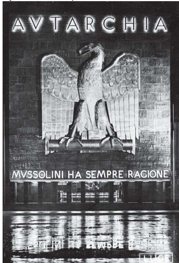
Panel with the motto "Mussolini is always right".

In order to individualize the canonic form of the fascio, distinguishing it from any precedent that was not the one of ancient Rome, and mainly from the republican and libertarian implications that it had taken on during the French Revolution (Scuccimarra, 1999), the consultancy of the senator Giacomo Boni, an Italian archeologist of great prestige, was requested. Boni performed his duties very quickly, aided by the multiple representations of sheaves present in the Roman sculpture: thus, the kind of fascio littorio constituted by the poles and by the log in a lateral position was imposed, and designed to occupy the whole space in the nation's iconography, more still than the eagle and the Roman she-wolf, and to signalize the transformation – officially sanctioned in 1926 – of a party emblem into a state emblem. In addition to the coins, the Italians would observe the fascio on the stamps, documents, public buildings, the new works of the regime, the uniforms, books, and advertisement posters.