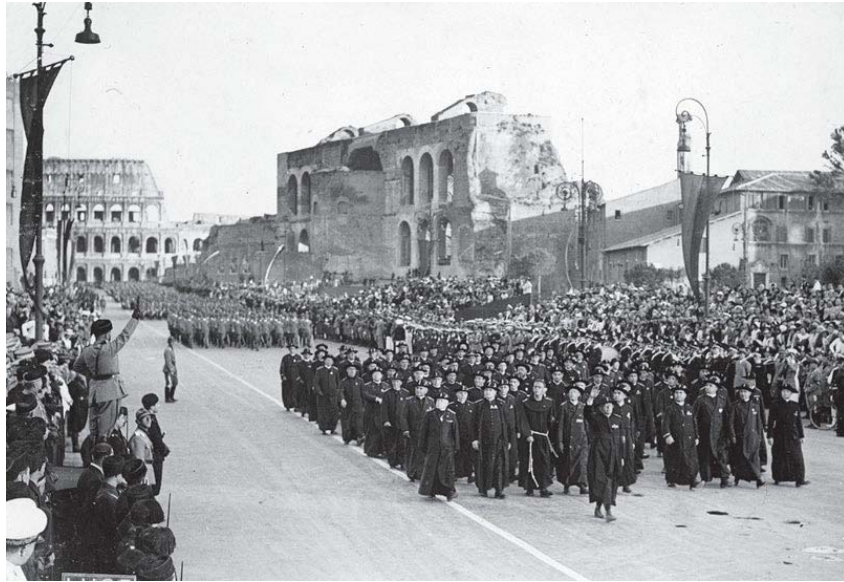
Mussolini inspects the military troops in Rome, Italy.

Discipline and power were the essential values of romanity that the fascists propounded for all Italians: but discipline was the power presupposition, because, without a hard and strong discipline, any aspiration to the empire would be an illusion, as attested by the African failures of the previous governments. The adoption by the fascism of the Roman imperial model in an updated expression of colonial power repeated, at the time, the traditional tones of the liberal foreign politics. However, an absolutely new factor was the adoption of romanity as a global model, which was valid as lifestyle for a party, for the armies, for the civil society: