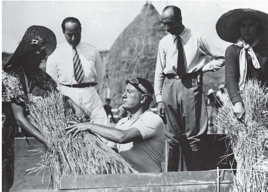
Benito Mussolini, surrounded by peasants, participates in the wheat harvest in Littoria, Italy.

A great prominence was also given to the agrarian tradition of the ancient Italy, which was perpetuated in the agrarian inclination of the contemporaneous Italy. This theme can be regarded as a crucial knot of multiple aspects of the fascist politics, some of them present along the whole 20-year period of fascism, others typical mainly of the thirties. As a matter of fact, it often appears in association with the campaign for the demographic development (the peasant families were more prolific than the others), with the autarchy that was proclaimed in response to the sanctions decreed by the Nations Association after the aggression to Ethiopia, with the specificity of the Italian establishments in the colonies (cultivators' establishments, it was repeated, in opposition to the mercantile character of the "plutocratic" empires), with the anti-bourgeois controversy, with the racial laws (see ahead), with the relation between the work in the fields and the warrior's worth: according to the fascist message, for each of those aspects it was possible to find a clear mirror in the history of the ancient Rome.