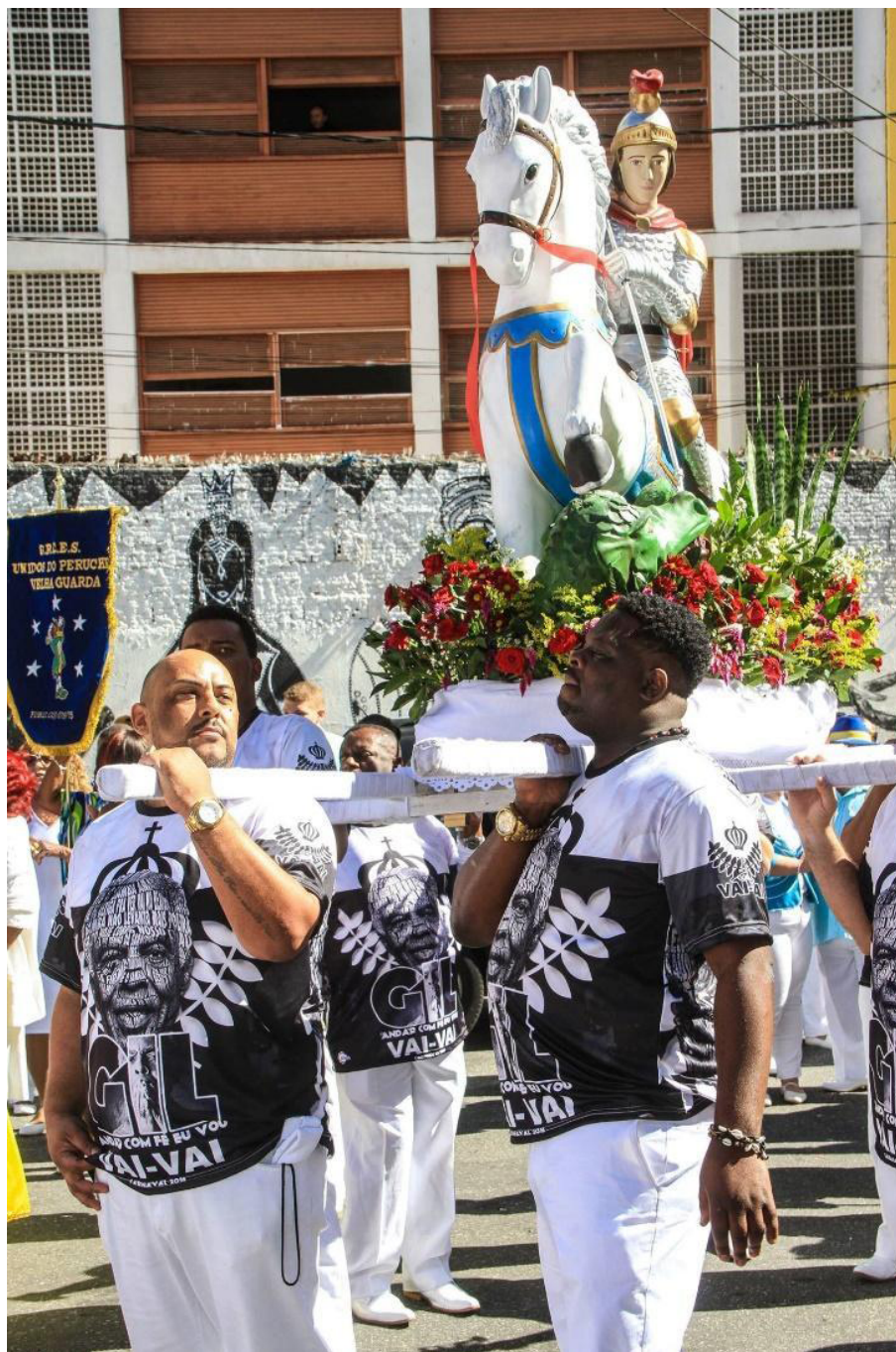
PICTURE 1 Ogum's feijoada in 2017.

On the way back to the court, São Jorge gives space to Ogum, who the community will revere. But not only him. Following the logic of Candomblé houses, several deities are greeted, as in a xirê . It starts with Exu, who receives his padê , followed by Ogum, Oxossi and other orixás . To each of them is offered a series of songs, which are accompanied by dancing, clapping and participant's great joy.