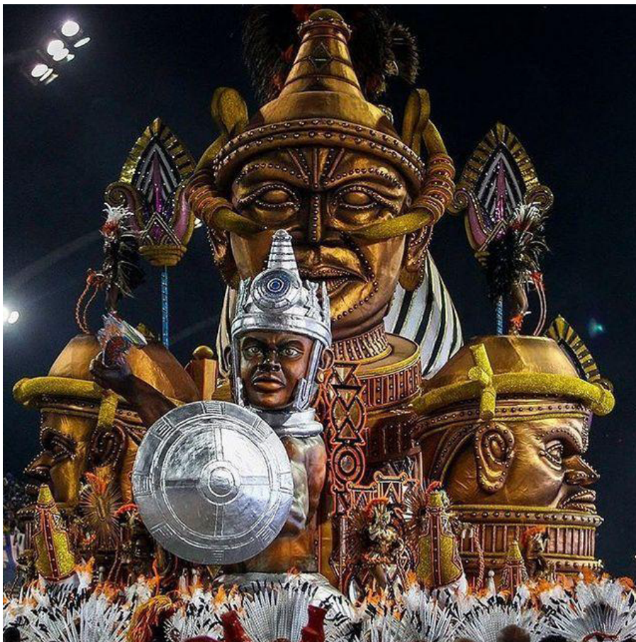
PICTURE 5 2019 Opening Float “Africa’s Civilizing Legacy”.