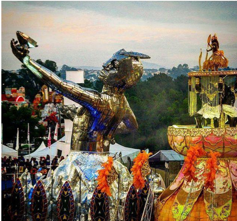
PICTURE 2 Vai-Vai opening float in 2010. "African Empire, 80 Years of Glory".