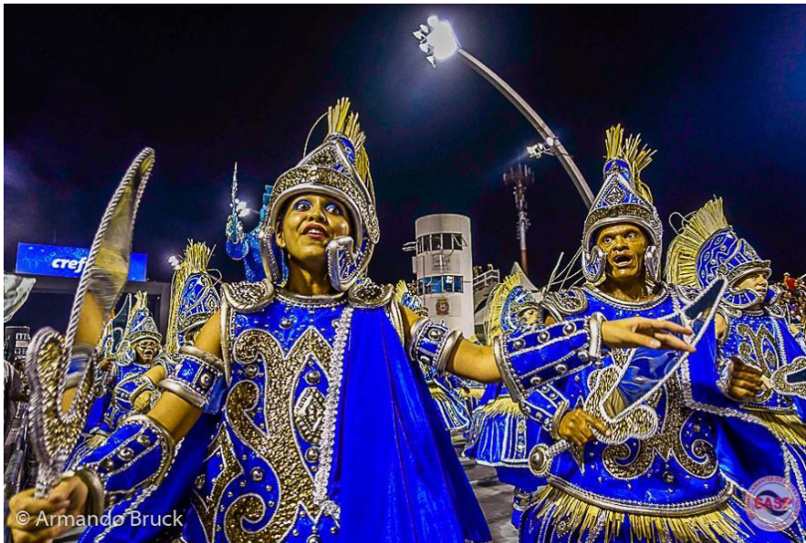
PICTURE 3 Wing “Ogum”, part of 2017 parade.

representations of Candomblé deities that formed the procession, in addition to a wing ( ala ) 11 devoted to Ogum, the association brought an allegorical element, with a very stylized representation of the divinity.