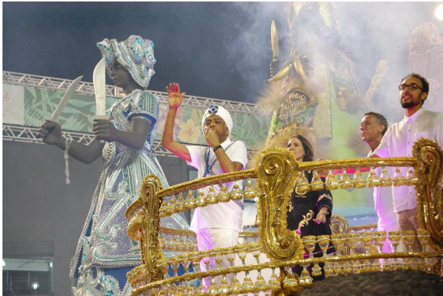
PICTURE 4 “Gil, son of Gandhy” float, 2018, with the image of Ogun next to the honoree Gilberto Gil.