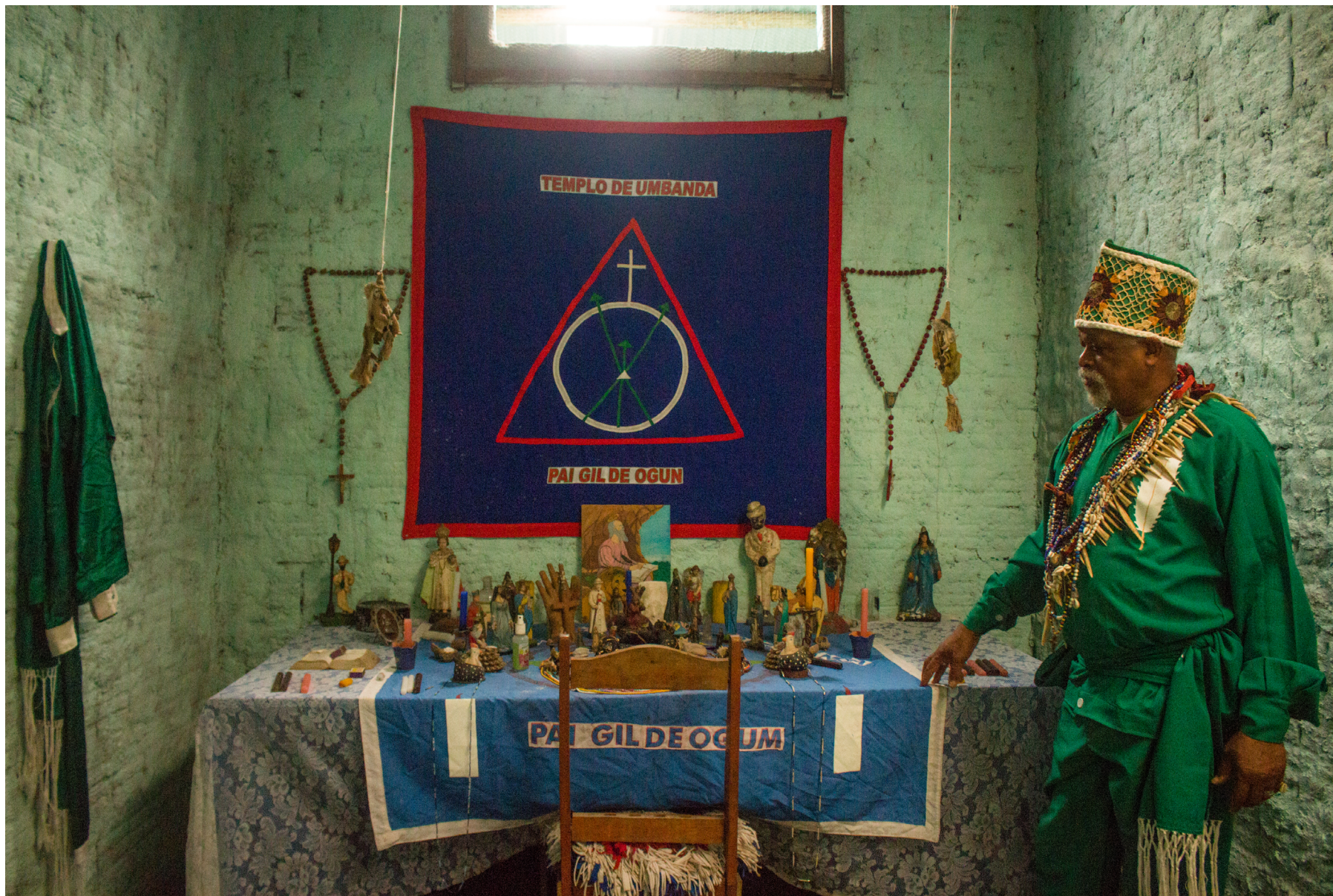
FOTO 4 Pai Gil de Ogum mostra sua mesa de jogo, é no processo divinatório e por meio dos caboclos guias que se revela a natureza e a causa da doença.