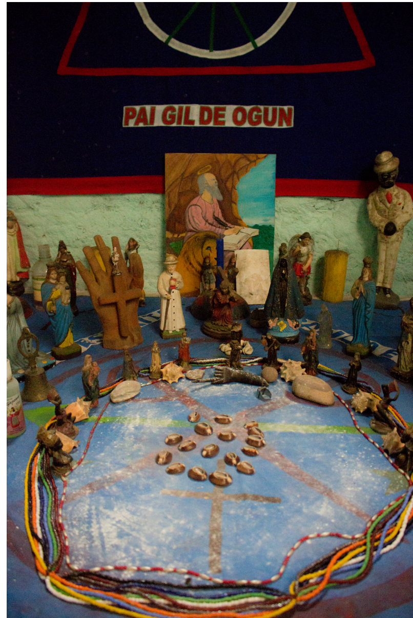
FOTO 5 Mesa de jogo