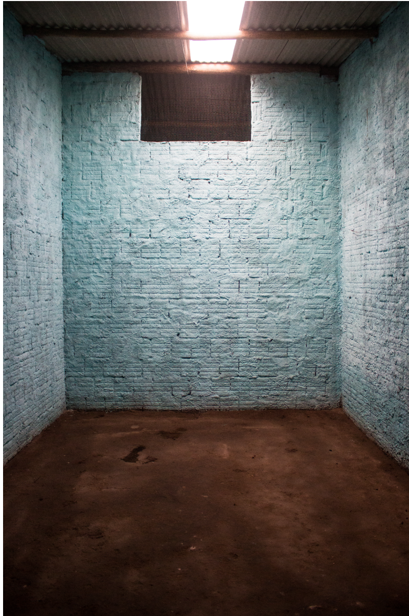
FOTO 3 quarto destinado a receber filhos de santo em processo de iniciação ou aqueles que buscam o terreiro para curar as mais