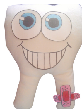
Figure 1: Happy "Favolas"

The use of the symbolic can then be designed as an intrapsychic process that aims to release the subject from ghosts, serving as a projection mechanism that provides, in a second moment, a relationship with the Other, partially released from this phantasmagoric pressure 29 .