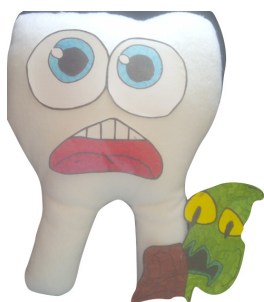
Figure 2: Sick and sad "Favolas"

On the other hand, the pictorial representation of a Sick Teeth refers to a figure tainted by the presence of holes and scratches/blemishes with fill, fractures, associating also in this profile, a pictorial representation of bacteria, figured in "bug"/dental caries subcategory and, curiously, when the Sick Tooth is anthropomorphized, it appears portrayed as an emotionally "Sad" Teeth 1,4 .