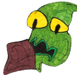
Figure 3: Pictogram: Bacteria and dental caries

In the "Favolas" figure the problem of dental caries is represented by a dark colored bug, on extent on empirical studies made previously, most children to draw dental caries, represent it as a bug or garbage, or as something disgusting (Figure 3) 9