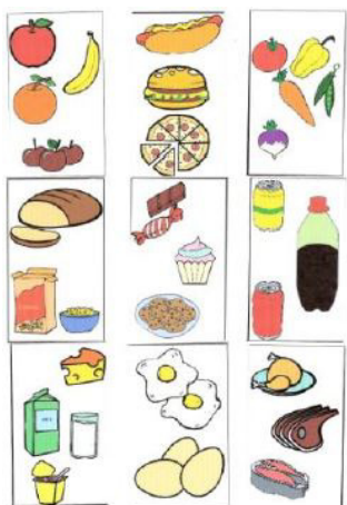
Figure 6: Food cards/pictograms

We developed, in a second stage, an interactive game which consists of several drawn cards using colored pictograms and non-cariogenic foods (Figure 6), where the child, according to experienced knowledge has to put the respective card in one of three boxes available: i) cariogenic food box (symbolized with a red cross), ii) non-cariogenic food box (symbolized with a green "right") and a third box for the cards that the children do not know whether if it corresponds to cariogenic or non-cariogenic foods (symbolized with a yellow question mark), this last box being implicit doubts that will be answered in the context of a Pediatric Dentist consultation (Figure 7).