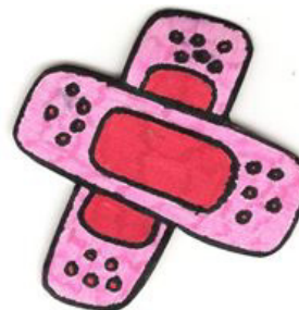
Figure 4: Pictogram: Dental treatment

We have also created a pictogram that seeks to represent the vulgar "plasters", symbolizing the treatment and restorative material (Figure 4).