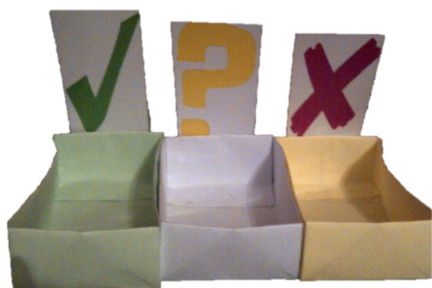
Figure : Food game boxes

This game should be presented to the child at the end of the consultation, in order to test/evaluate her knowledge about the food cariogenicity, and its implementation is overseen by the Dentist as an educational act to the patient after the game final outcome.