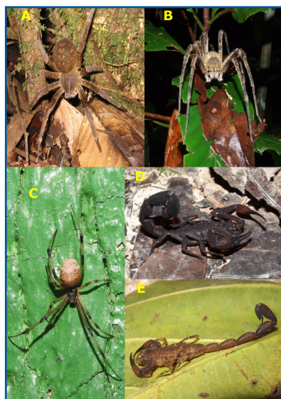
Figure 2: Pictures of some species of spiders and scorpions of medical interest present in the Upper Juruá region. A) Phoneutria fera ; B) Phoneutria reidy ; C) Latrodectus geometricus ; D) Tityus metuendus ; E) Tityus silvestris .

of days of hospitalization of the patients, no significant differences were observed. No deaths were recorded during the study period. There was no correlation between spider and scorpion accidents with rainfall over the months during the study period ( r = -0.3450 ; p = 0.1742 ; n = 72 ). When analyzed separately, no correlation was observed between spider incidents ( r = 0.0870 , p = 0.8718 , n = 72 ) and scorpions incidents ( r = -0.2131 , p = 0.0486 , n = 72 ) regarding rainfall. In relation to the distribution of spider and scorpion accidents between rainy and dry seasons, a significant difference was observed (Table 1), since spider bites occurred more during the rainy season (57.6%) and scorpion stings during the drier months (58.1%).