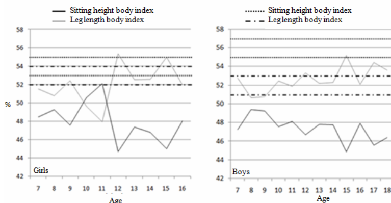
Figure 2: Body proportion of girls and boys with DS based on chronological age, classified according to Phantom reference values.