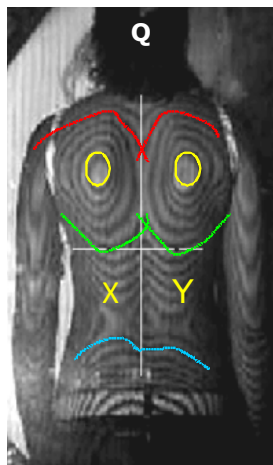
Figure 2: Analysis points of MT. Red - "M1" superior, Yellow circles - "O"; X and Y- verification points of fringe discrepancies; Blue - "M2"; PQ - Line C7 to gluteal interline (Knackfuss et al 13 ).

Descriptive analyzes were performed on the following variables: total body mass, height, BMI, appearances or not of scoliosis, type and segment of scoliosis, the average time for analysis and diagnosis, as well as analysis of the operating cost of the equipment.