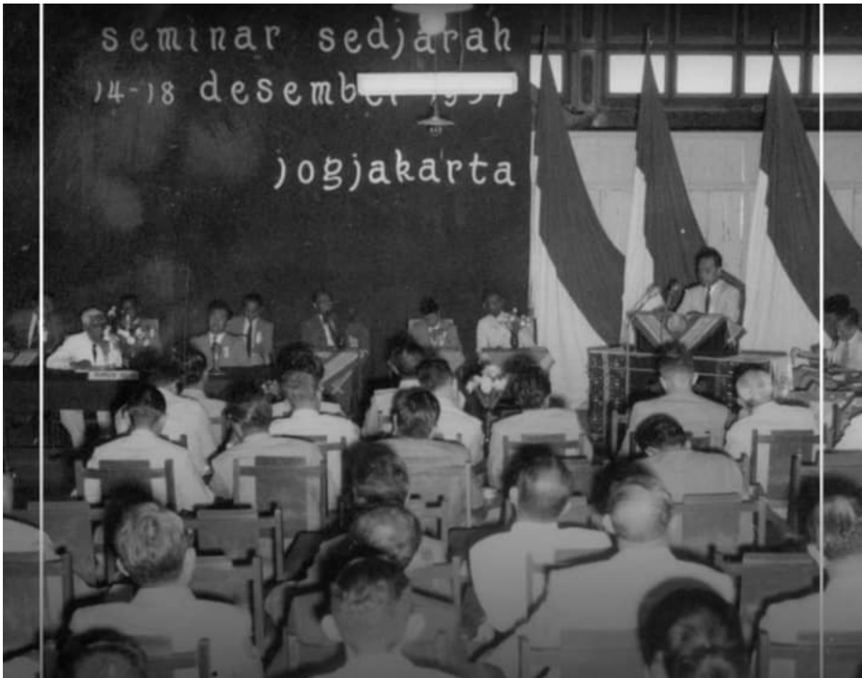
Fig.3. Opening of the First National History Seminar