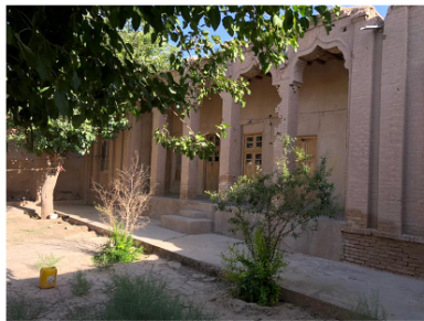
a) Summer rooms