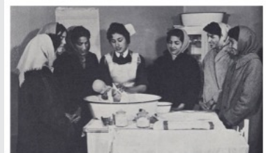
c) Kabul Hospital: Educating Young Mothers on Post-Natal Care (1960s).