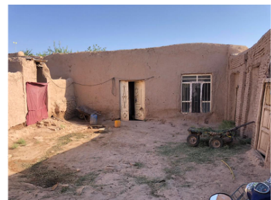
f) Entrance and guest room