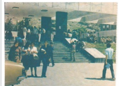
d) Entrance to the Faculty of Medicine in Kabul (1977).