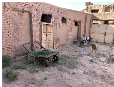
e) Cattle house in winter