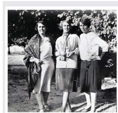
a) Photo is taken in 1927.

The Taliban, primarily originating from rural villages in southern Afghanistan, seized power for the first time from 1996 to 2001, imposing strict rules that curtailed movement, education, and the values women's movements had fought for throughout the century. In 2001, the US War