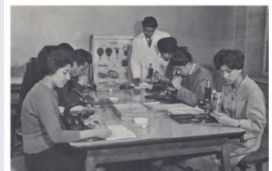
b) Biology class, Kabul University (1960s).