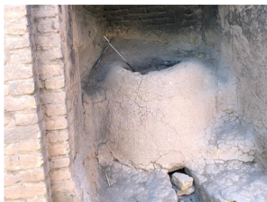
d) Bread oven