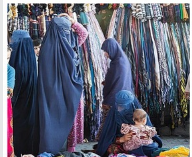
e) Photo is taken in 2021.

*All photos are licensed under the Creative Commons