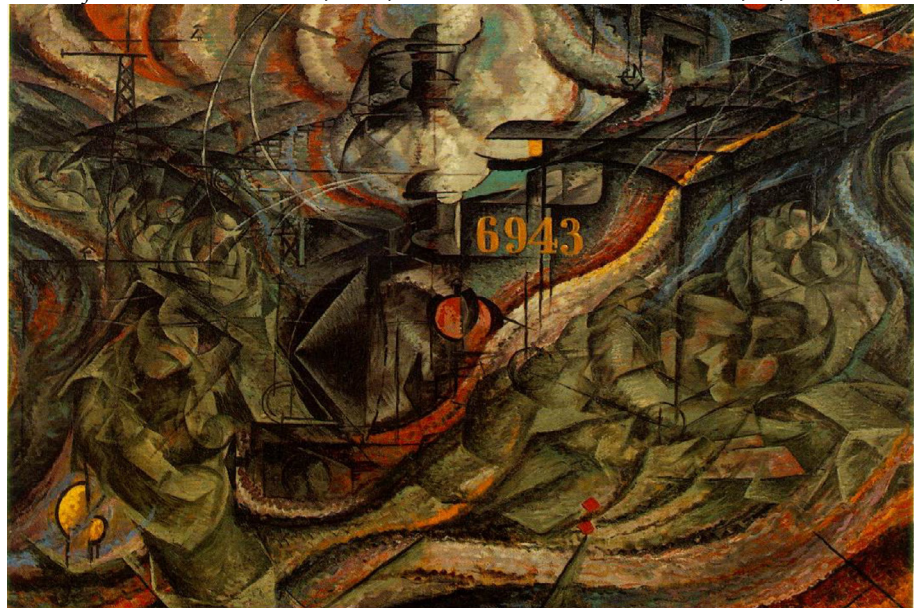
States of Mind I: The Farewells, 1911, Umberto Boccioni. Oil on canvas, 70,5x96,2cm.