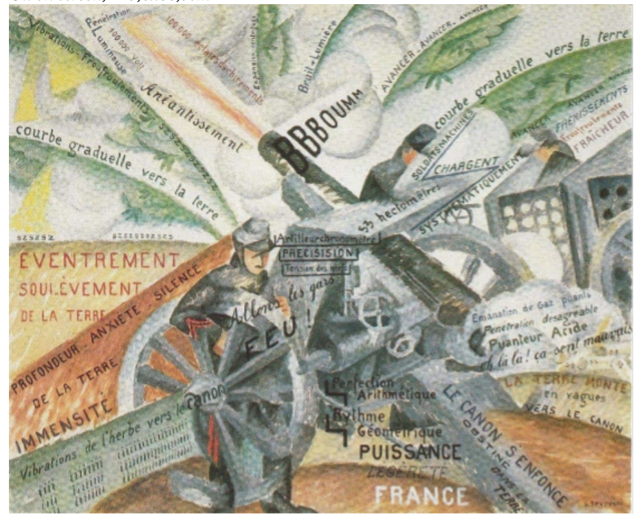
Figure 6 Cannon in action (Cannoni in azione), 1915, Gino Severini. Oil on screen, 115,8x88,5cm