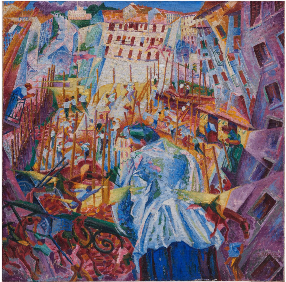
Note. Sprengel Museum, Hanôver.

The street enters the house (La strada entra nella casa), 1911, Umberto Boccioni. Oil on canvas, 100×100,6cm