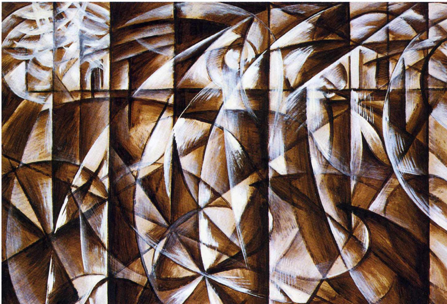
Note. Museum of Modern and Contemporary Art of Trento and Rovereto.

Automobile speed, light and noise (Velocitá d'automonile), 1913, Giacomo Balla. Oil on canvas, 109x84cm