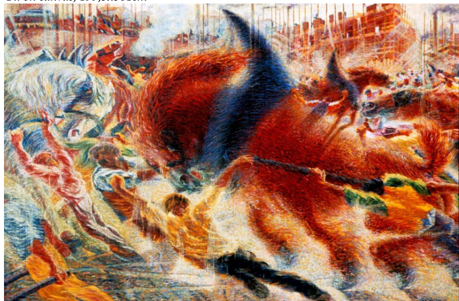
Note. Museum of Modern Art (MoMA), Nova York.

The awakening of the city (La città che sale), 1910, Umberto Boccioni. Oil on canvas, 199,3x301cm