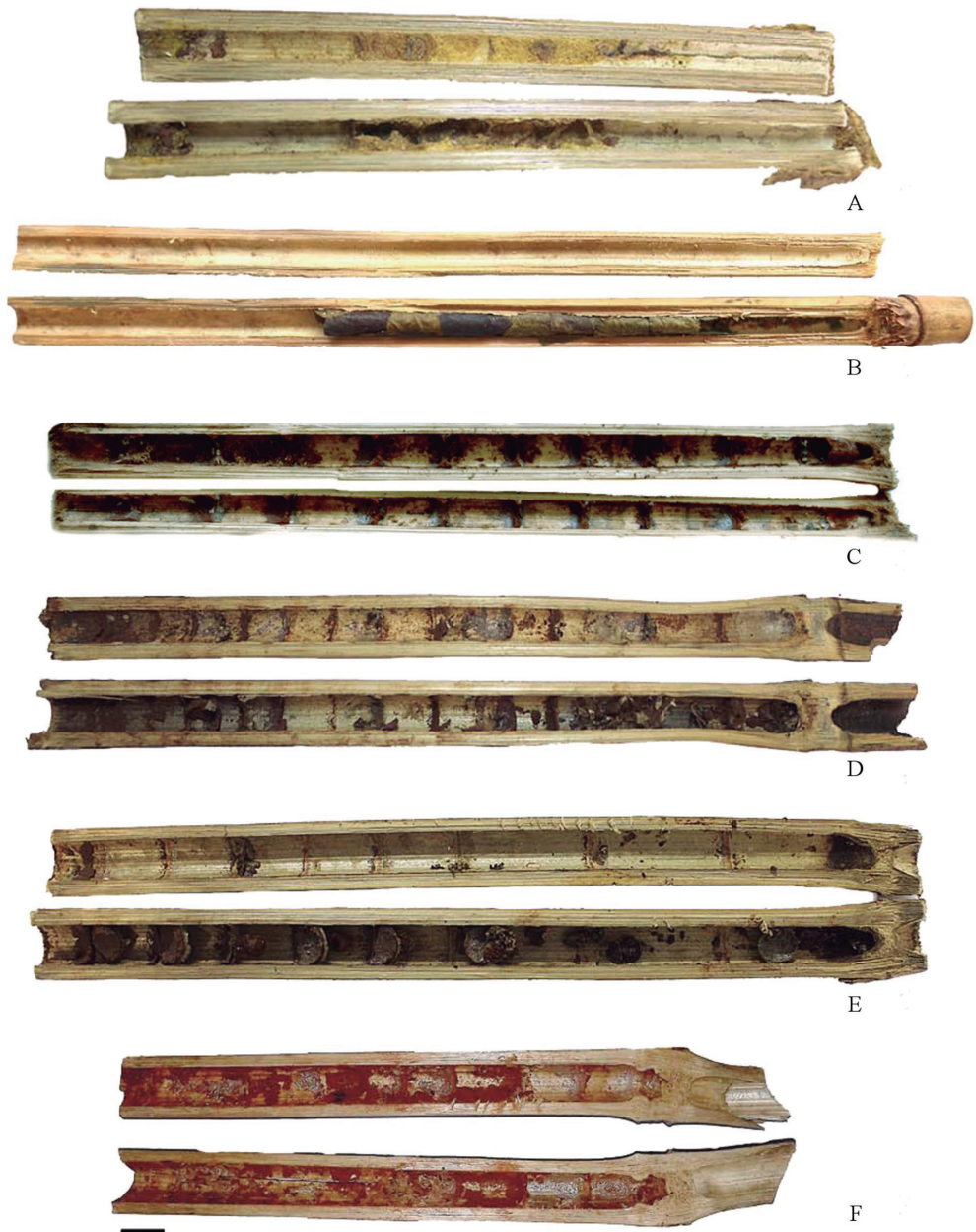
FIGURE 2: Trap nests in Parque Estadual São Camilo (Palotina, Paraná), (A) Centris analis , (B) Megachile susurrans , (C) Monobia angulosa , (D) Pachodynerus grandis , (E) Pachodynerus guadulpensis , (F) Zethus smithii . Scale bars: 1 cm.

The aculeate nest occupation rate obtained in the present study, less than 1%, is considered very low when compared with other studies. The occupation rate is variable, a 7% was found by Buschini &