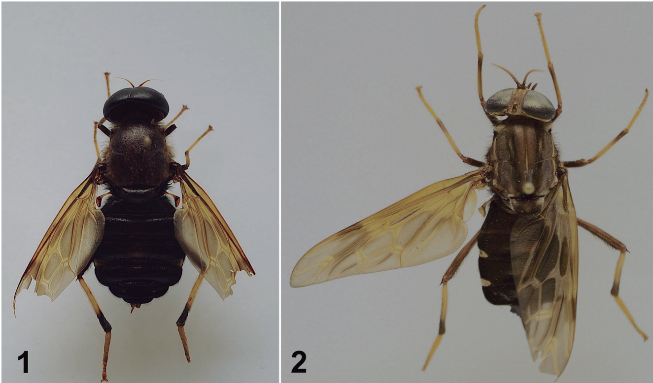
Figures 1-2. Pantophthalmus pictus (Wiedemann). (1) female Male (total length = 33 mm). (2) Female (total length = 35 mm).