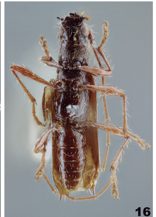
Figures 9-16: (9-12) Eurysthea noqueira sp. nov., holotype, female: (9) dorsal view; (10) lateral view; (11) ventral view; (12) detail of head, dorsal view. (13-16) Eurysthea nakagomei sp. nov., holotype, male: (13) detail of head, dorsal view; (14) dorsal view; (15) lateral view; (16) ventral view.