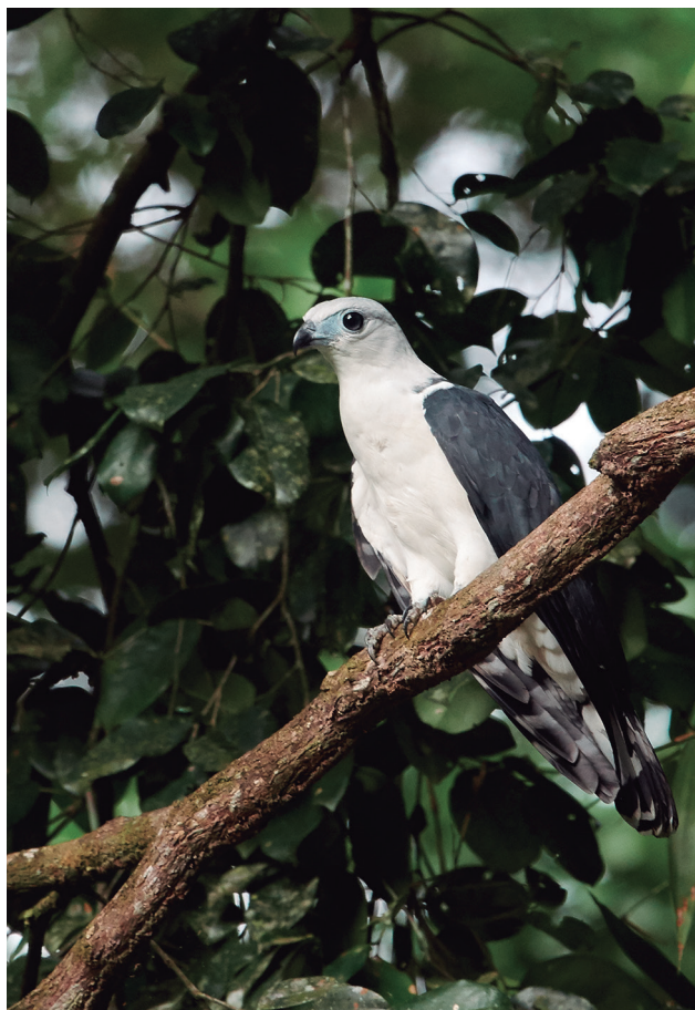
Figure 1. Adult of White-collared Kite ( Leptodon forbesi ).

Here we use Ecological Niche Models (ENM henceforth) to evaluate the environmental variables influencing L. forbesi distribution and the extent of the areas climatically suitable for the species. Information on habitat suitability presented here has the potential to inform future conservation actions for the maintenance of L. forbesi preferential habitat (see Thorn et al. , 2008; Marco-Júnior & Siqueira, 2009; Wu et al. , 2012; Giorgi et al. , 2014).