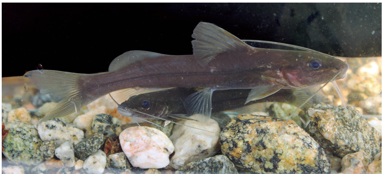
Figure 4. Live specimens of P. longipinnis , showing the coloration in life (preserved in MZUSP 116324).

Pimelodella longipinnis is so far known only from Southeastern Mata Atlântica streams at the estuarine region of Santos municipality. Both Rio Quilombo and Rio Jurubatuba have stretches protected by a Brazilian park, the Parque Estadual da Serra do Mar (PESM) (Fig. 5), which is the largest Protected Area of Mata Atlântica rainforest, with 332 hectares, covering 25 municipalities from São Paulo and Rio de Janeiro States (Fundação Florestal, 2021). Despite collections inside PESM have not been authorized, we believe that P. longipinnis distribution might include protected areas inside the PESM. Therefore, P. longipinnis is categorized herein as Least Concern (LC) according to the International Union for Conservation of Nature criteria (IUCN, 2012).