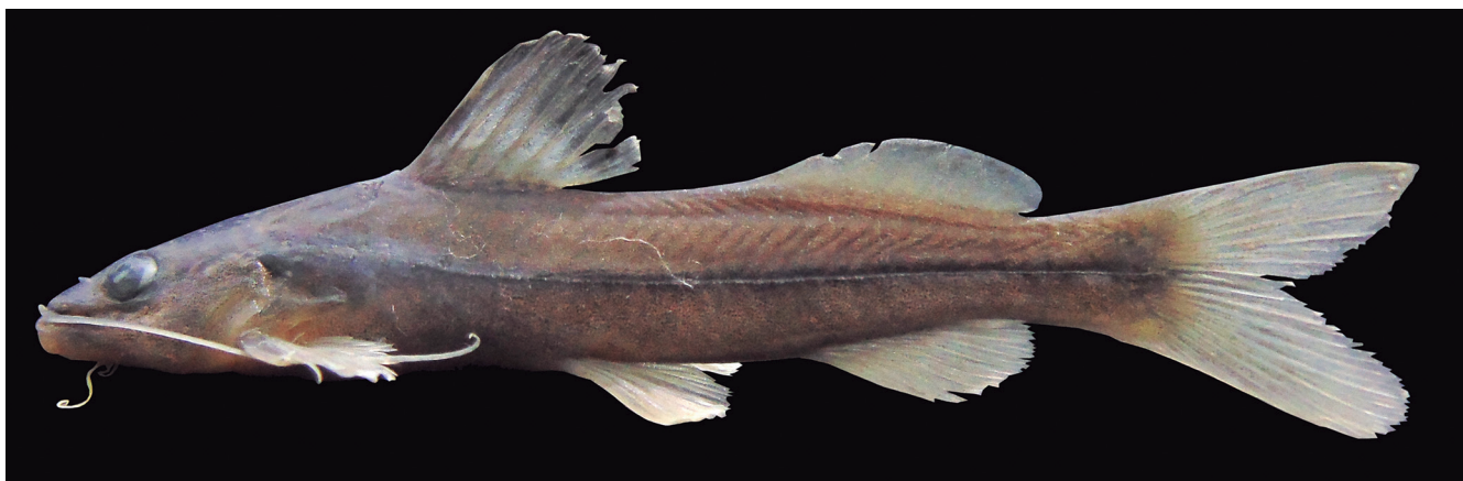
Figure 3. Left lateral view of an ethanol-preserved, recently collected specimen of P. longipinnis , MZUSP 116324, 57.6 mm SL.

Background body coloration mostly brown, ranging from dark brown dorsally to light brown or yellowish on ventral region of head and body (Fig. 3). Overall head coloration medium brown, with visible dark grey pigment along posterior fontanel, corresponding to a sheet of pigment covering the brain at this region. Dorsal region of maxillary barbel covered with dark brown to gray chromatophores. Outer and inner mental barbels hyaline. A poorly-defined, narrow, dark brown to dark gray midlateral stripe extending from orbit to caudal fin origin, where it broadens, and continues at median caudal-fin rays (Fig. 3). Poorly-defined darker region near dorsal fin base, varying from dark brown to dark gray coloration. Poorly-defined dark brown to dark gray col-