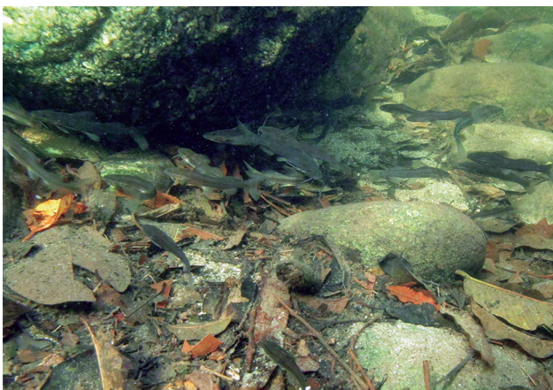
Figure 6. Subaquatic photograph at Rio Quilombo, a rocky bottom stream where part of P. longipinnis specimens were collected (MZUSP 116324). Photograph by Douglas Rey, December 2, 2014.