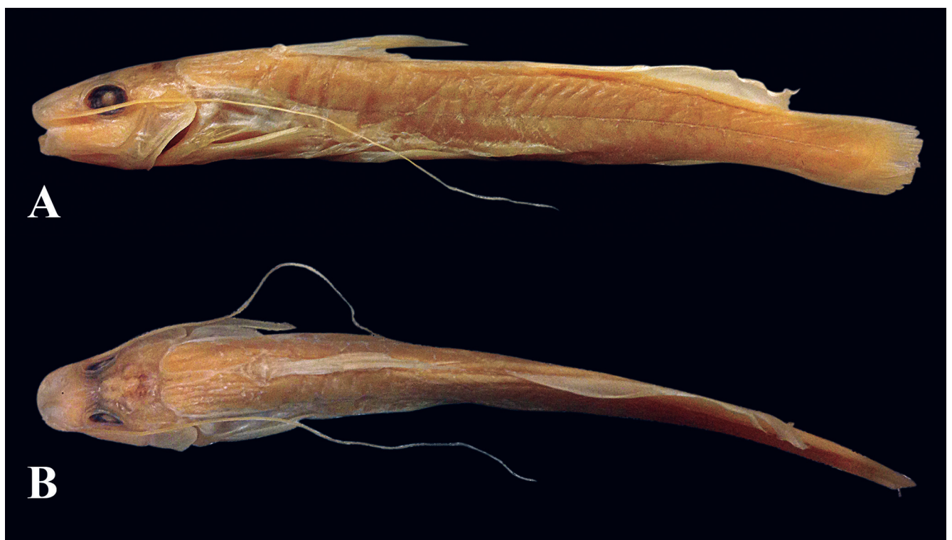
Figure 1. Left lateral (A) and dorsal (B) views of Pimelodella longipinnis (Borodin, 1927), AMNH 8642, holotype of Rhamdella longipinnis , 84.6 mm SL.

Dorsal fin triangular, with concave distal margin. Longest dorsal-fin ray length four to six times in SL, its depressed tip reaching verticals through half or last fourth of adpressed pelvic-fin. Dorsal fin 1,6 (49) plus anterior spinelet. Distance between terminus of dorsal-fin base and adipose-fin origin roughly equal to dorsal-fin base. First dorsal-fin pterygiophore inserted posterior to neural spine of vertebrae 5 (5); last dorsal-fin pterygiophore located posterior to neural (or pseudoneural) spine of vertebrae 10 (5). Unbranched dorsal-fin ray spinous for ca. 50-70% of its length, distal portion filamentous. No ornamentations on anterior or posterior margins of dorsal-fin spine. Pectoral-fin rays 1,7 (5) or 1,8* (45), pectoral fin