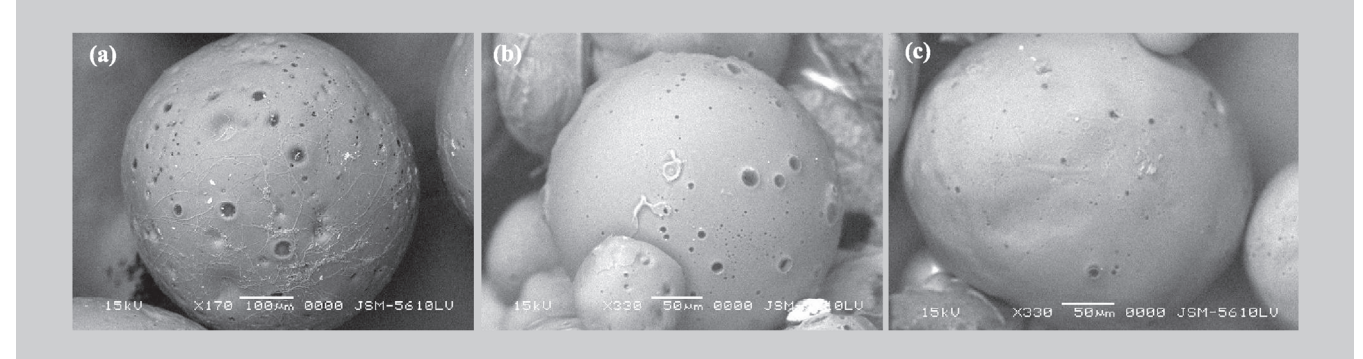
FIGURE 1 - SEM photomicrographs of floating microspheres of verapamil hydrochloride.

microspheres X-ray opaque barium sulphate was incorporated into the microspheres. The amount of X-ray opaque material in these microspheres was sufficient to ensure visibility by X-ray but at the same time the amount of barium sulphate (10mg per g of microspheres) was low enough to enable the microspheres to float. The duration of floating in vitro was more than 8 h. The microspheres did not adhere to the gastric mucous and floated on the gastric fluid for about 3.2 \pm 0.05 h (Figure 2).