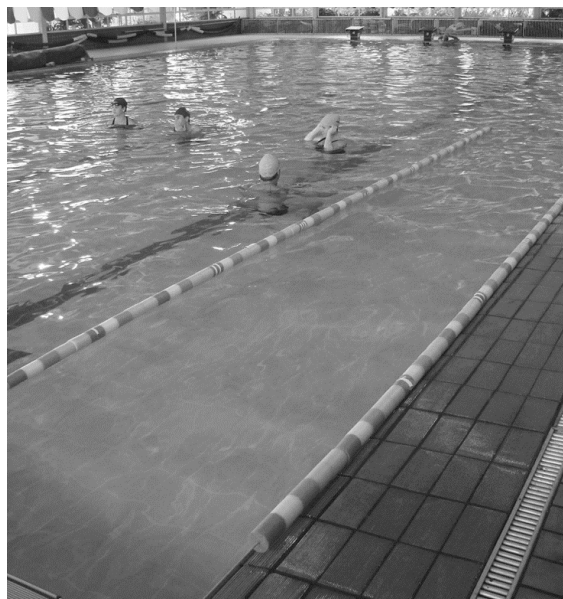
FIGURE 1 – Data collection setting with purpose built reference system

Data were collected in a 25 m heated indoor pool (29°C) between 0.90 m and 1.50 m deep, with a purpose built reference system consisting of coloured lane ropes as shown in FIGURE 1.