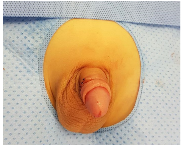
Figure 5 - Post-operative aspect of a buried penis, after reconfiguration of penile and preputial skin