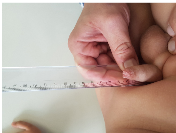
Figure 7 - Obese patient with FOUPA. Note that with compression of the prepubic fat the penile measurement is normal