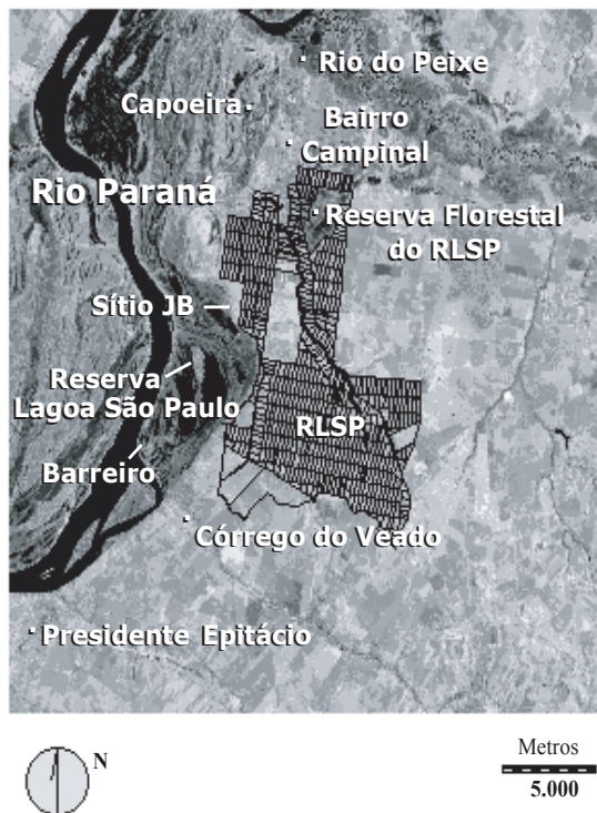
Figure 2. Location of the collection sites: fixed and exploratory. Porto Primavera Dam, 1997. RLSP: Sao Paulo Lake Resettlement

small breeding areas, pipettes were used. 14 In the time period prior to the filling of the lake, seven locations were researched among natural and artificial breeding grounds. After the lake formation, two natural breeding grounds were analyzed.